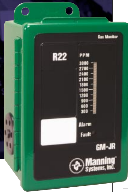
(optional GM-JR readout shown)