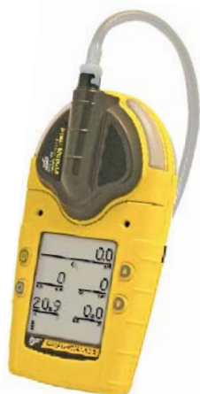
GasAlertMicro 5 with integrally attached pump