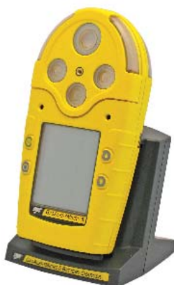
Optional rechargeable battery and slip-in cradle charger